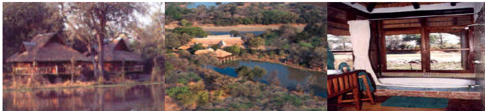
Victoria Falls, Tongabezi