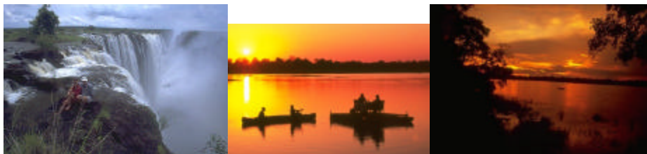
Makgadikgadi, Jack's Camp