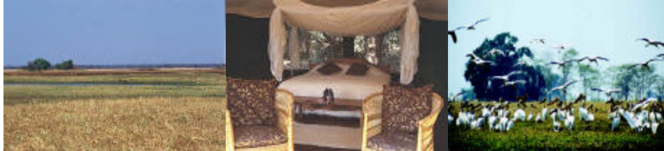
Lake Tanganyika, Kasaba Bay Lodge